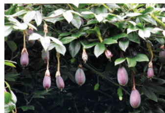
Banana passionfruit Passiflora tarminiana, P. tripartita

→ Vine invades lowland forest, climbing over trees and forest canopies