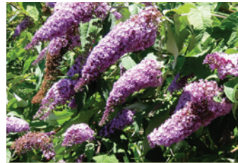
Buddleia Buddleja davidii

→ Fast growing shrub/small tree; dense growth blocks out light slowing regeneration