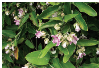
Moth plant Araujia hortorum

→ Lowland forest invasive climber, dominating the tree canopy and completely smothering trees