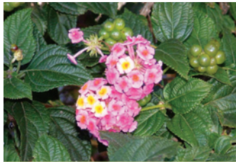
Lantana Lantana camara

There are 12 problem weeds that you and your community can join forces to help us bring under control: