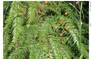
Climbing asparagus Asparagus scandens

→ Dense mats cover the ground crowding out all other plants