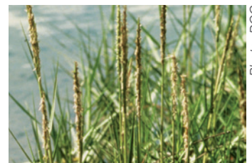
Spartina Spartina alterniflora, S. anglica, Spartina x townsendii

→ Rampant vines form large masses in forest canopy, blocking light and smothering native plants