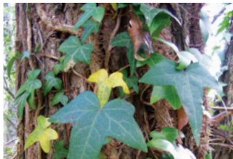
English ivy Hedera helix

→ Quickly spreads in dense thickets, blocking light and choking native plants