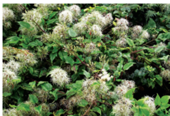
Old man's beard Clematis vitalba

→ Covers forest floor and smothers soft-barked shrubs and trees