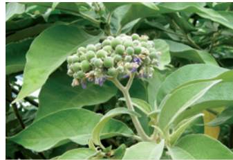
Woolly nightshade Solanum mauritanium

→ Spreads into dense thickets and outcompetes native plants