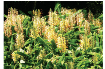
Wild ginger Hedychium gardnerianum

→ Small tree takes over threatened habitats and riverbeds