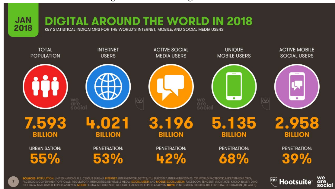
Figure 1: Internet usage worldwide

Internet usage worldwide is becoming increasingly ubiquitous, as figure 1 from Hootsuite and we are social shows. 45