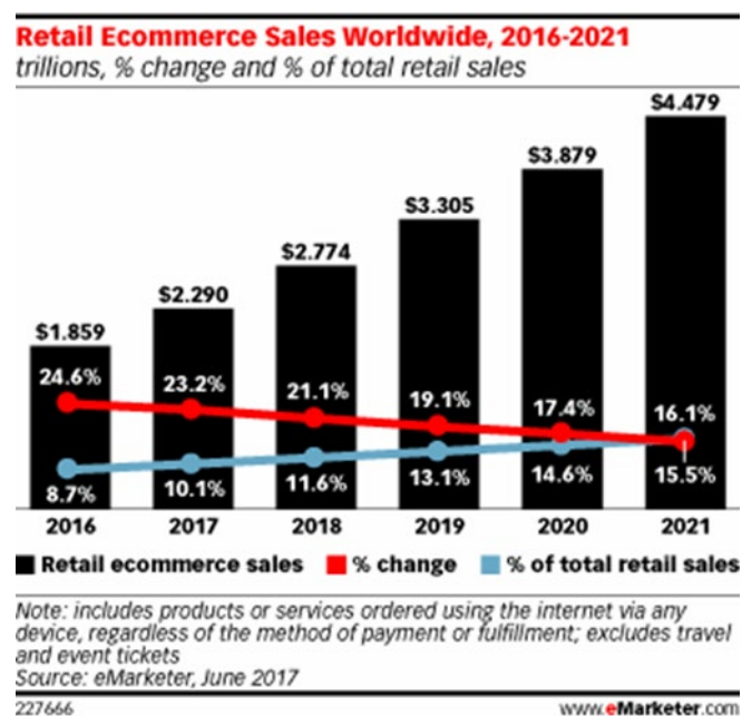
Figure 2: Anticipated size of the retail e-commerce market

The total global ecommerce market was estimated to be worth US$7.7 trillion in 2018 50 (including both the retail and business to business market). The retail ecommerce market (which excludes the business to business transactions) was estimated to be worth US$2.3 trillion in 2017, with a projected rise to nearly US$4.5 trillion by 2021. Figure 2 sets out the anticipated size of the retail ecommerce market, together with its growth rate and share of total retail revenue.