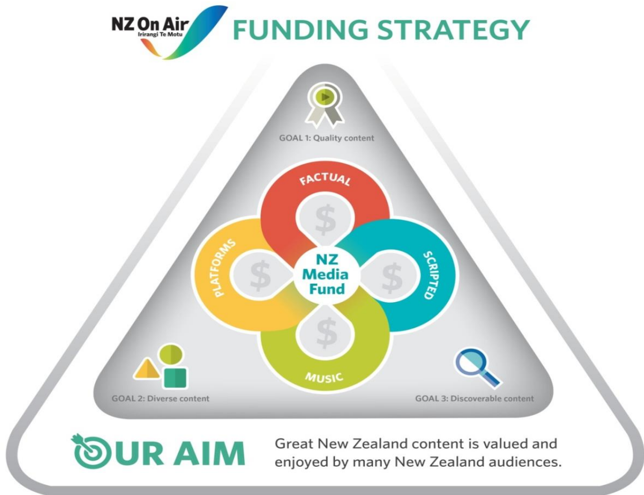
Figure 2: Funding strategy summary

Our funding strategy has three core goals: